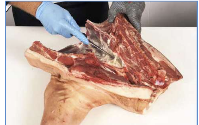
3 Remove the collar by following the natural seams ...