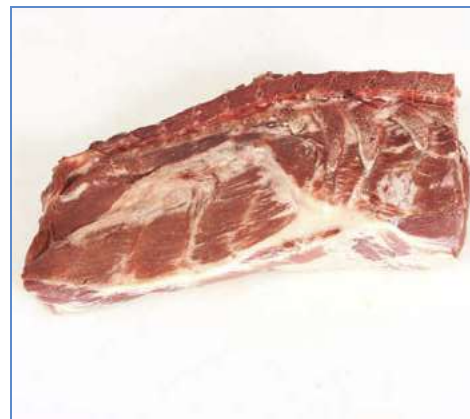
6 Collar of Pork – bone-in.