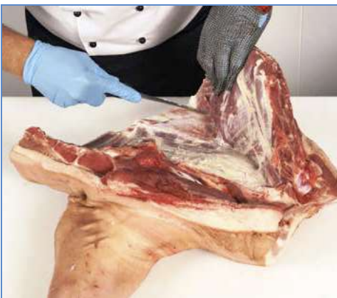
4 ... trying not to cut into the muscle. Continue following the seams leaving ...