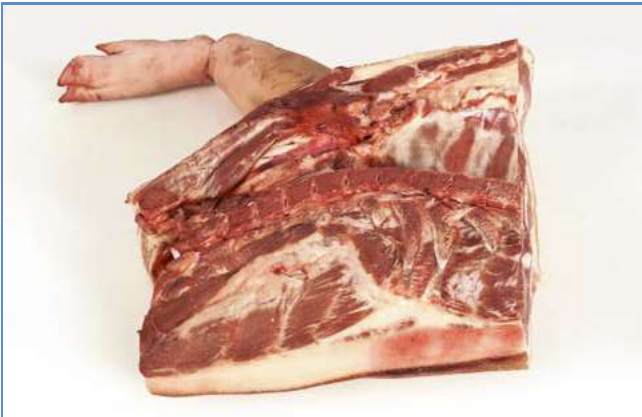
1 Fore end of pork including foot.