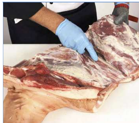
5 ... the back fat on the shoulder block until the collar is separated from the shoulder.