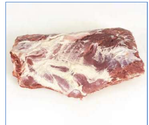
7 Collar of Pork – bone-in.